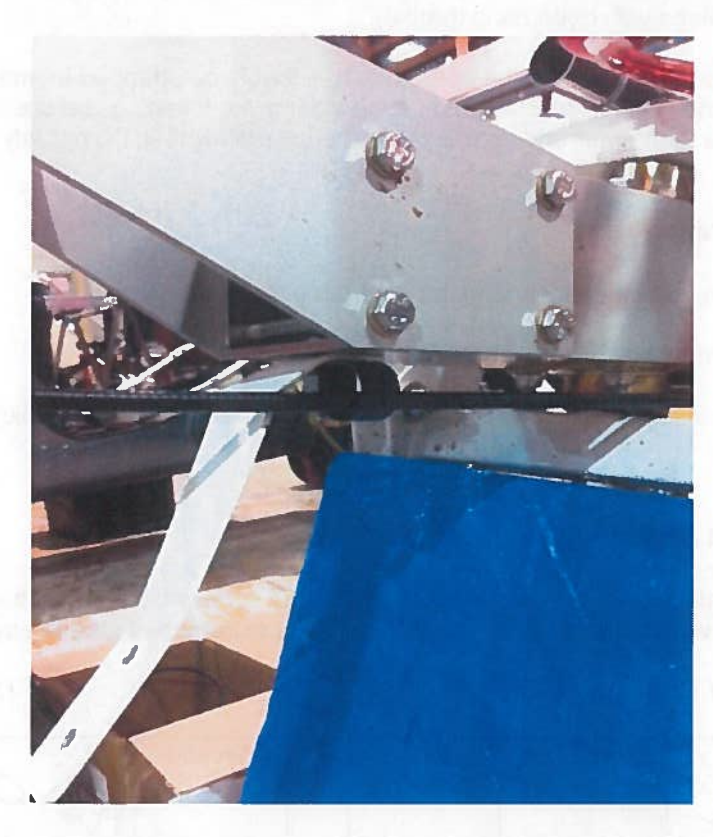
Fig 1 Fit a nylon P clip part no. 032-342 to the front lower bolt on the trike basetube.